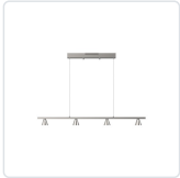
LP19937-BN Brushed Nickel